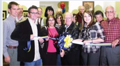
CASA of Lafourche's ribbon cutting ceremony celebrated becoming an independent non-profit organization and member of the Thibodaux Chamber of Commerce in November 2009.

CASA of Lafourche became an independent non-profit organization in October 2009. In the month of November, they had their biggest training ever, swearing in 17 new volunteers. To date, 59 volunteers have been trained and 64 children served.