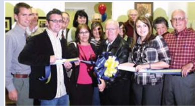
CASA of Lafourche's ribbon cutting ceremony celebrated becoming an independent non-profit organization and member of the Thibodaux Chamber of Commerce in November 2009.

CASA of Lafourche became an independent non-profit organization in October 2009. In the month of November, they had their biggest training ever, swearing in 17 new volunteers. To date, 59 volunteers have been trained and 64 children served.