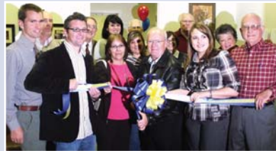
CASA of Lafourche's ribbon cutting ceremony celebrated becoming an independent non-profit organization and member of the Thibodaux Chamber of Commerce in November 2009.

CASA of Lafourche became an independent non-profit organization in October 2009. In the month of November, they had their biggest training ever, swearing in 17 new volunteers. To date, 59 volunteers have been trained and 64 children served.